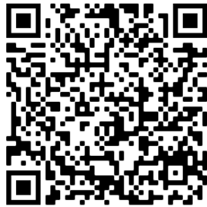
FVF Registration Form

All Other Forms: felixventures.org (document tab)